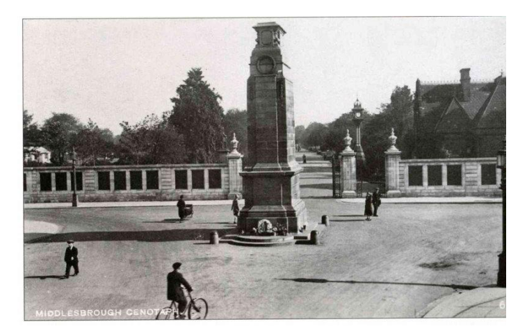
Cenotaph before pedestrianisation

masons. Tablets by Birmingham Guild Ltd. Gates renewed 1981. Polished grey Aberdeen granite ashlar cenotaph, iron gates, Portland stone ashlar gate-piers and walls, and bronze tablets. Cenotaph c.17m west of wide gateway with flanking pedestrian gateways, screen walls and short projecting end returns and terminal piers. Cenotaph: rectangular-plan pedestal and truncated shaft, supporting deep stepped and moulded base of chest tomb, with gadrooned band and panelled tablets on sides and ends. North and south faces of shaft inscribed: "THE GLORIOUS DEAD 1914-1919, 1939-1945". On ends of shaft and pedestal pilaster strips flanked at heads by bronze husk drops and topped by bronze wreaths. Pedestal on 2 broad steps, shaped at ends, and with glinters at angles. 2-leaf central gates and one-leaf pedestrian gates. Original side panels with elaborate scrolls and strapwork and similar crestings. Fieldedpanelled gate-piers, with moulded plinths, deep cornices and ornamented urn finials. Screen walls have banded rusticated pilaster strips between groups of tablets; stepped plinth, cornice and similar piers at ends. Tablets, in moulded surrounds, have raised lettering recording names of fallen in The First World War; 12 tablets on each wall. Faceted ball finials on end piers. East faces of walls have plain raised panels." Historic England.