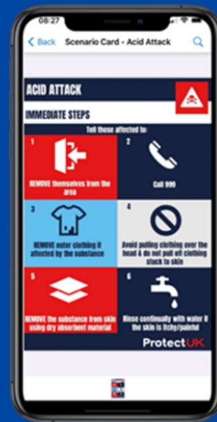
Addition of Action Cards