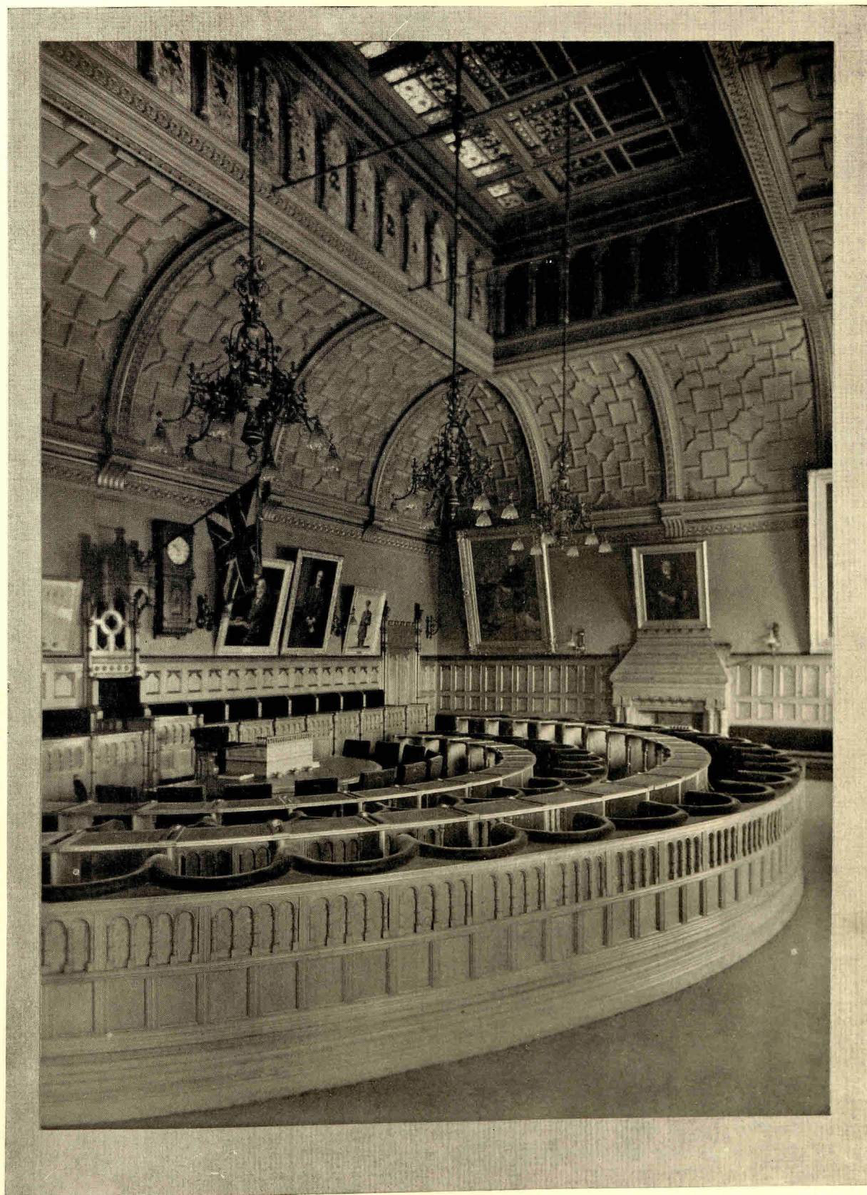
THE COUNCIL CHAMBER, Municipal Buildings.