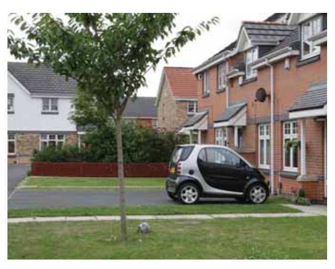
The Turnstile, Ayresome - successful inner housing

1.12 Support was expressed for the identification of future sites for the University to expand into, in order that it can contribute effectively to the economic prosperity of the town. The preferred