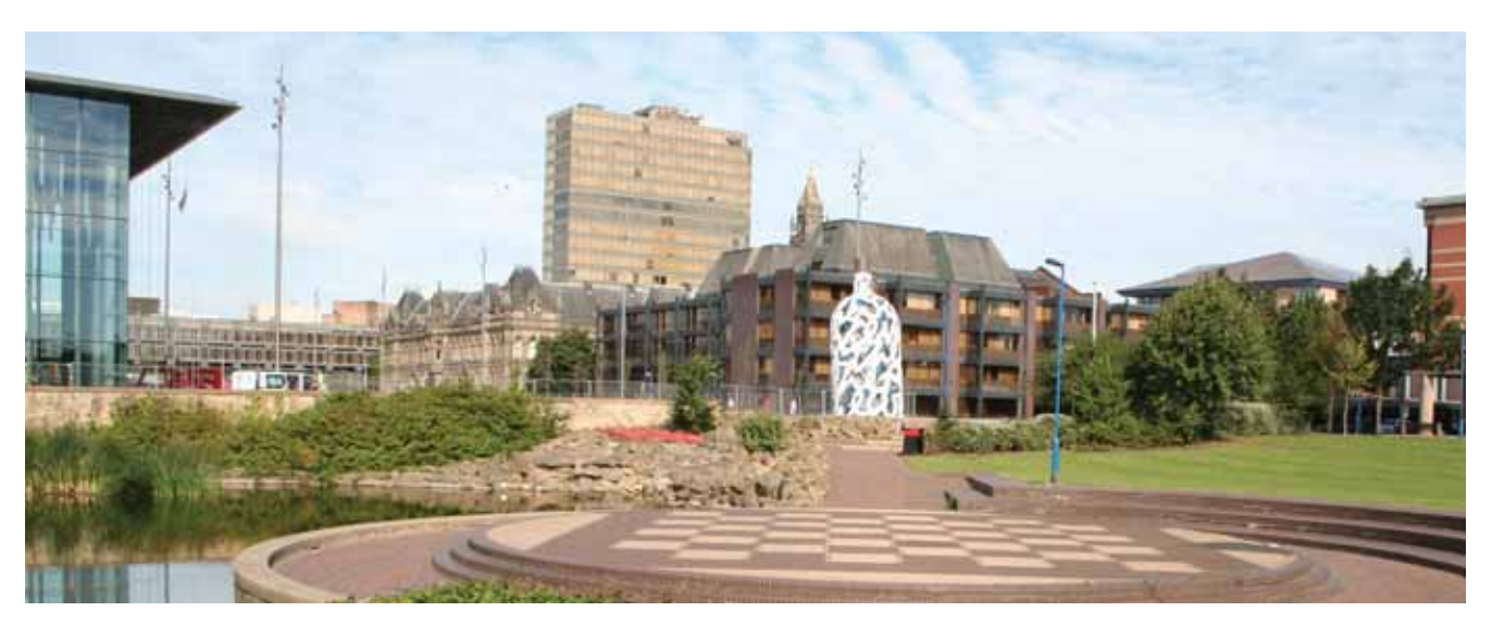
Centre Square East

8.30 It is important to ensure that stronger north-south linkages are created, specifically to Corporation Road and beyond to Middlehaven via the network of small spaces.