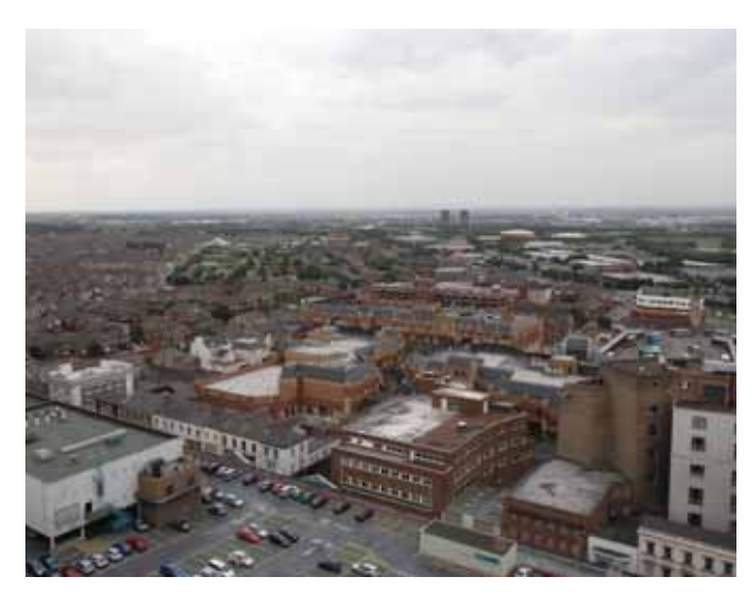
Older terraced housing near the town centre