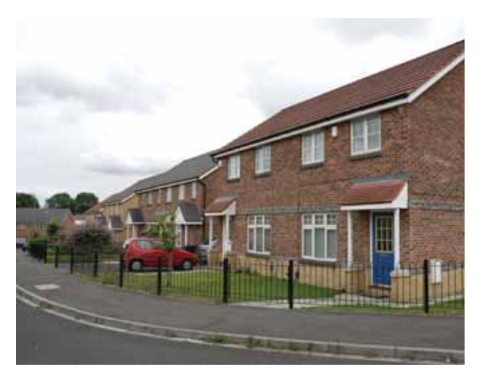
Modern housing in Grove Hill