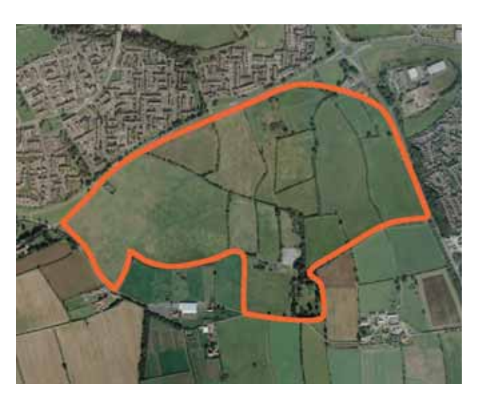
An aerial view of the Hemlington Grange site

A masterplan will need to be approved by the Council for the development of Hemlington Grange before planning permission is granted for any constituent part of the development area.