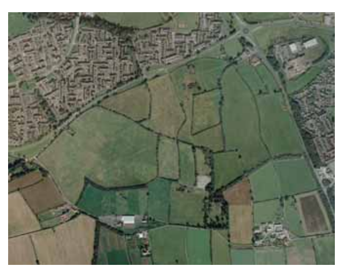
An aerial view of the Hemlington Grange site

There was support for improvements to the quality of development in Riverside Park and the need to improve its riverside edge and its interface with Greater Middlehaven. There was also support for the Green Blue Heart to enhance transport and leisure provision and to create a meaningful heartland for the new urban core to the city region.