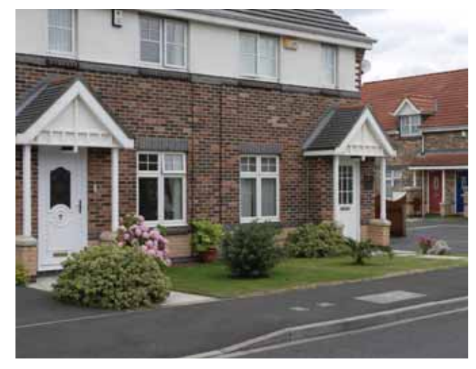
The Turnstile, Ayresome