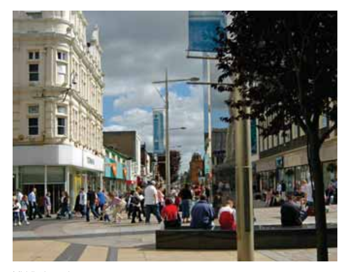
Middlesbrough town centre

A masterplan will need to be approved by the Council before planning permission is granted for any constituent part of the development area.