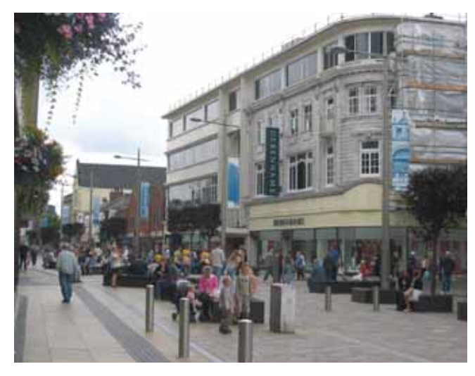
Middlesbrough's busy town centre