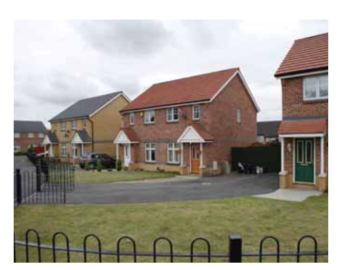
Modern housing in Grove Hill