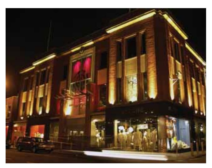
Psyche - the designer department store on Linthorpe Road

The sustainability appraisal recognised that the town centre policies are likely to have a beneficial effect on expanding and developing the town centre, promoting economic growth and ensuring high and stable levels of employment.