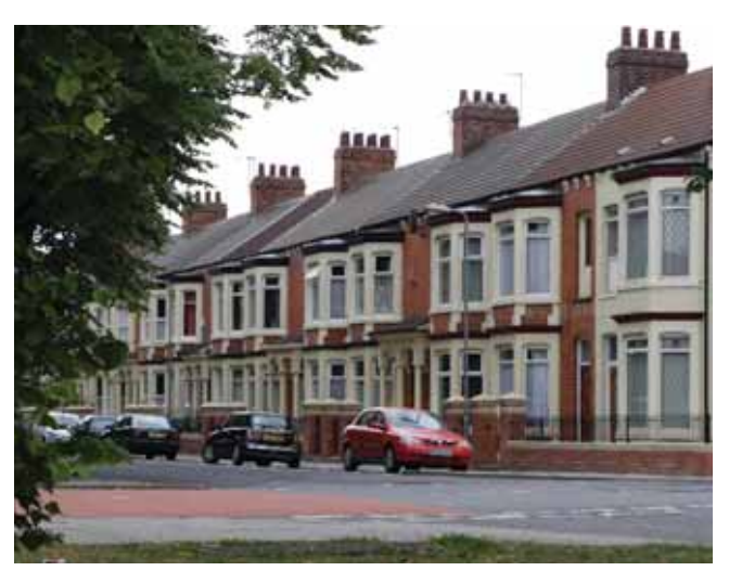
Victorian Housing, Abingdon

The Regional Housing Strategy and the published RSS for the north east recognise the need to replace obsolete housing and restructure failing housing markets in order to provide a wider choice of better quality housing to meet future needs.