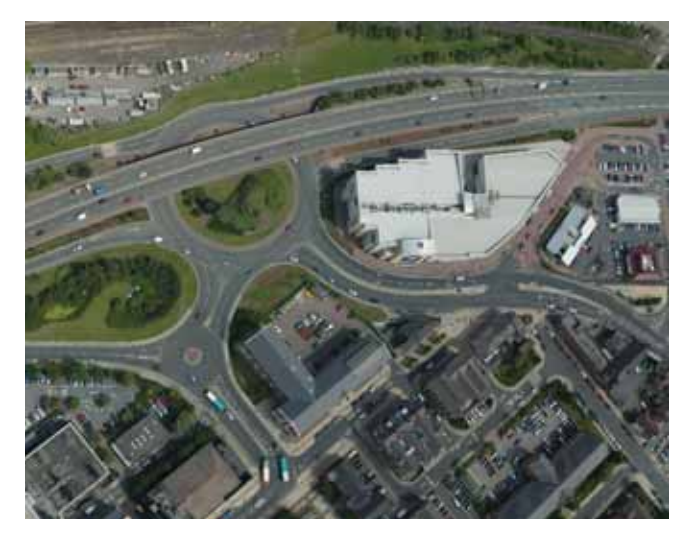
An aerial view of the Marton Road/A66 junction close to Middlesbrough town centre