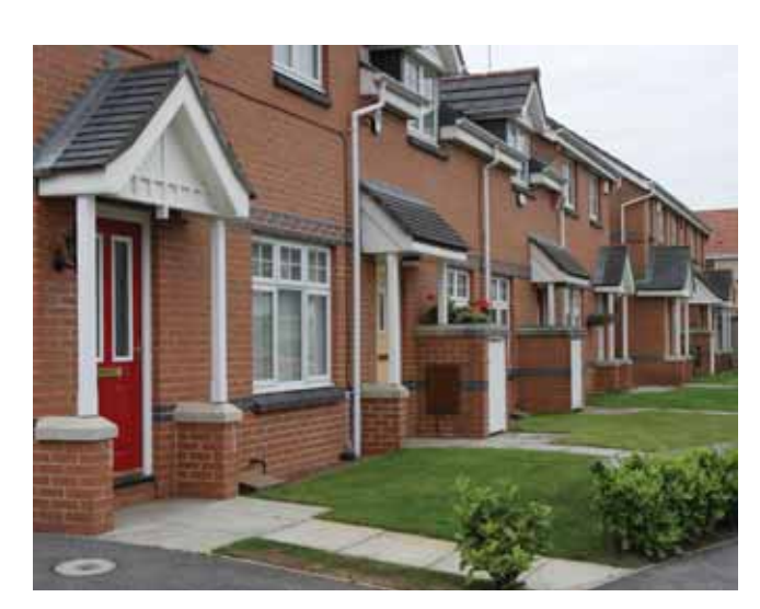
The Turnstile, Ayresome - successful inner housing