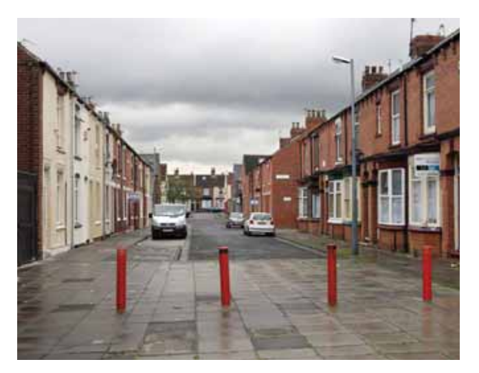
The Gresham area of inner Middlesbrough

delivery through four inter-linked Neighbourhood Action Plans: