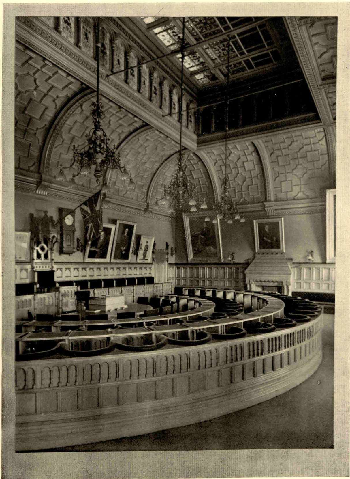
THE COUNCIL CHAMBER, Municipal Buildings.